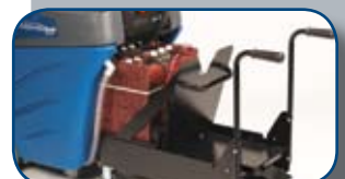
Battery Exchange Cart