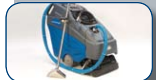
On-Board Accessory Wand