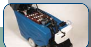
Easy Access To Batteries & Components