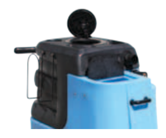
Large tank lids

The M-12 has two unique cleaning modes, to allow you to clean almost every surface in your building!