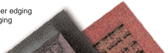
L-R: rubber edging fabric edging